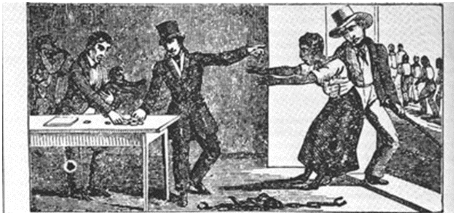
SELLING A MOTHER FROM HER CHILD.

Stripped naked Sold to highest bidder Family's divided "Breeder" were valuable