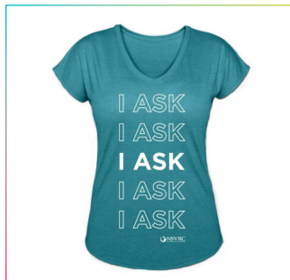
V-Neck - Also available in black