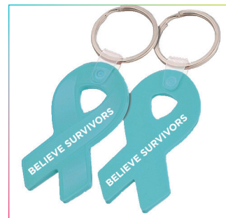
Believe Survivors Keychain