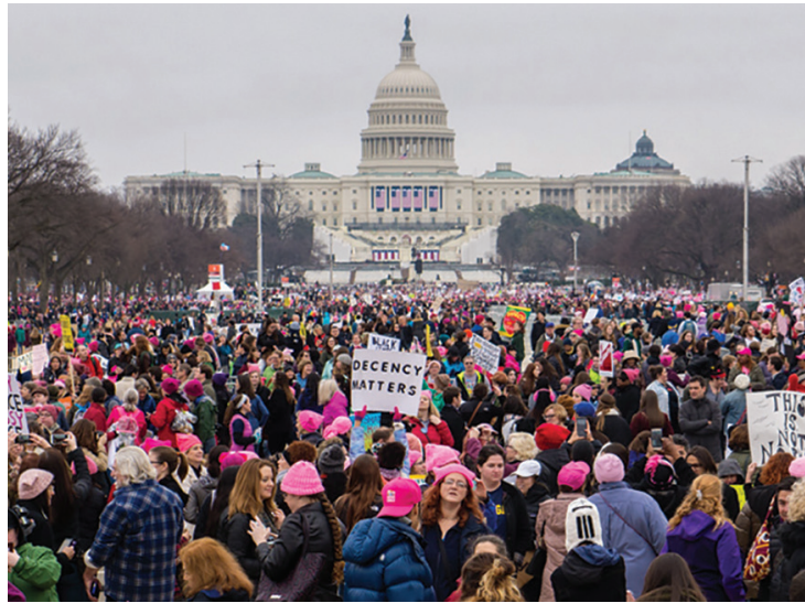
Women's March on Washington, DC.

allegations of sexual assault and harassment by prominent figures in the entertainment industry. #MeToo continued to expand beyond just Hollywood. The energy surrounding the movement galvanized states to enact new laws, companies to examine and revamp their policies, and individuals to have hard conversations with friends and loved ones about what sexual assault and accountability look like.