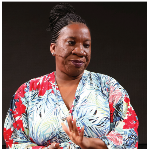
Tarana Burke.

Activist, community organizer, and advocate Tarana Burke began using the phrase “Me Too” in 2006 to raise awareness about the prevalence of sexual abuse and assault, particularly for Black women and girls while working at a nonprofit she founded focused on the well-being of young women of color. She coined the phrase, “me too” after a young girl disclosed that she was experiencing sexual abuse