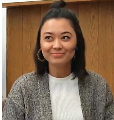
Chanel Miller.

virtually every aspect of her life. Later, the statement was posted on BuzzFeed and went viral, since it spoke to the shared experience of many survivors of sexual assault. It was shared across the internet, discussed on national news outlets, and even read aloud by members of the House of Representatives. Doe's statement gave a vivid, well-crafted voice to the experiences of countless other survivors. Three years later, in 2019, the author of the statement revealed that her name was Chanel Miller when she published a memoir called Know My Name expounding on the assault, the court case, and the subsequent attention.